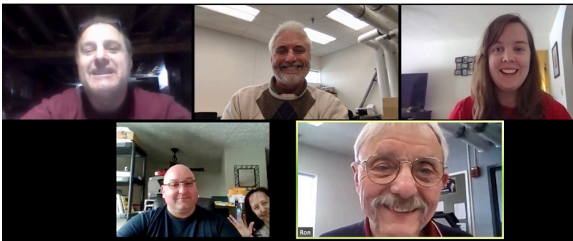
Zooming with the Staff

The staff and I meet every day via Zoom from 9:00 to 10:00 so that we can work closely together and improve our work every day. I and other school leaders have been involved in three Zoom DOE per week along with several other weekly Zoom meetings with various DOE departments as we work together through a radical, but temporary, change to our educational system.