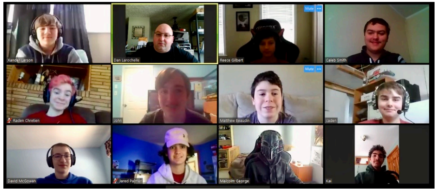
Zooming with Wright

Daily attendance will be a matter of completion of assignments and attendance on the required Zoom meetings.