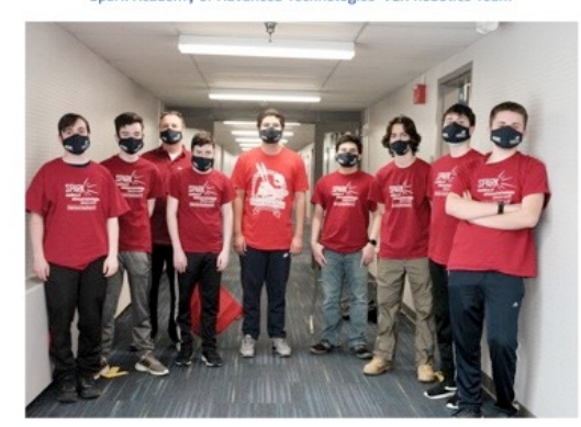
Join us as team members share their robot; design, construction & refine process; and experience in competition!

April 2, 2021 7:00 PM Spark Academy of Advanced Technologies' VEX Robotics Team